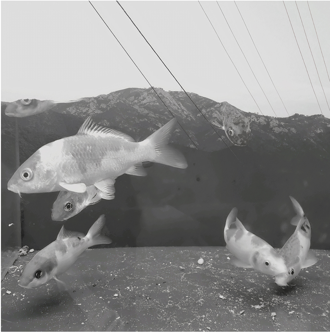
Fragmented, series4#308 / 2015 / Abstract Landscape