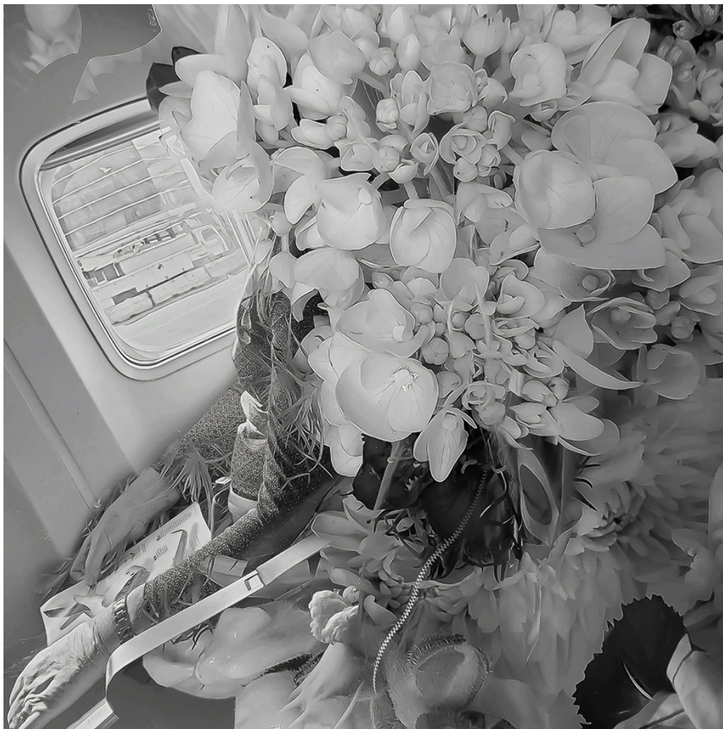
Fragmented, series1#2 / 2014 / Abstract