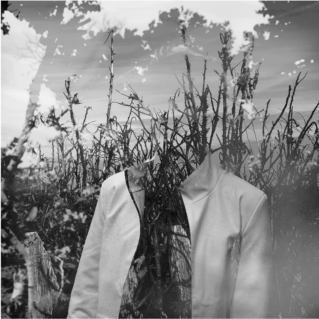
Fragmented, series 4#325 / 2022 / Abstract Portrait