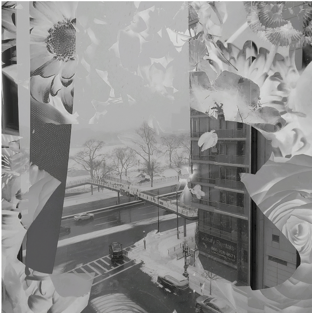
Fragmented, series2#65 / 2022 / Abstract City