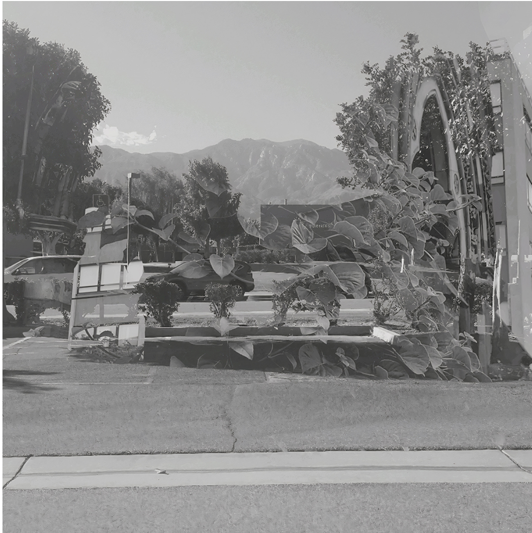
Fragmented, series 2#179 / 2015 / Abstract

As she continued to explore her love of photography, Starkey began to see her own face in a few art exhibits, but remained more comfortable behind the camera than in front of it. Living in Romania during a time of transformation, Starkey witnessed the raw expression of uncensored voices that emerged after the fall of communism.