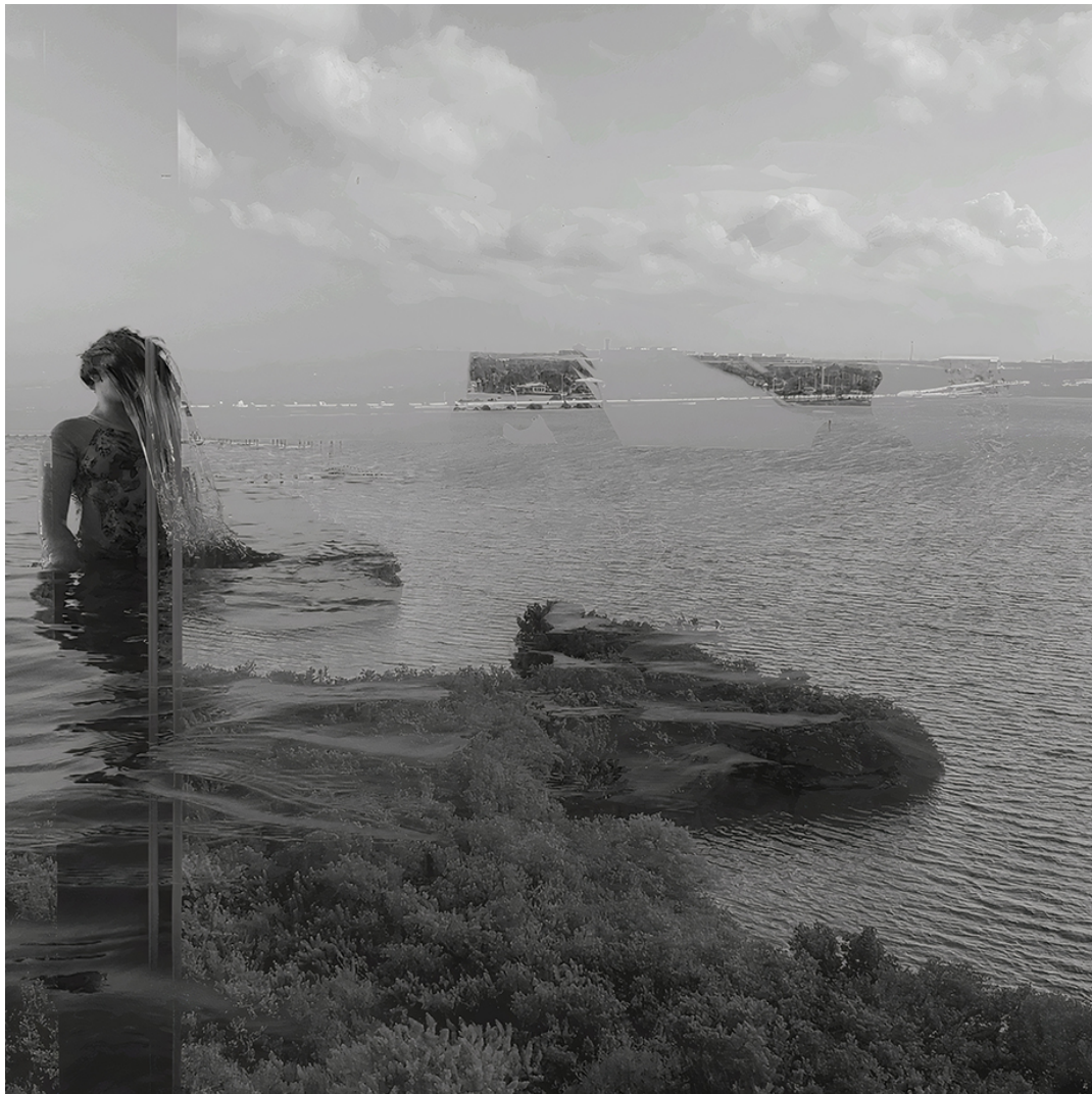
Fragmented, series 3#139 / 2019 / Abstract Landscape