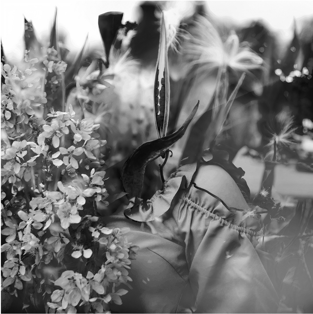
Fragmented, series1#53 / 2022 / Abstract Portrait