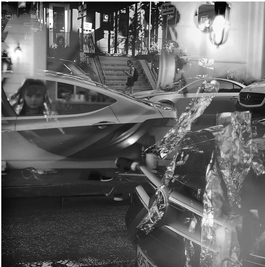
Fragmented, series1#9 / 2018 / Abstract City