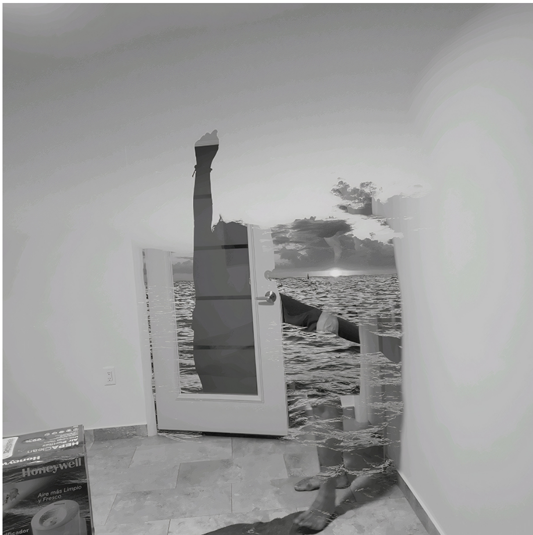
Fragmented, series2#155 / 2018 / Abstract